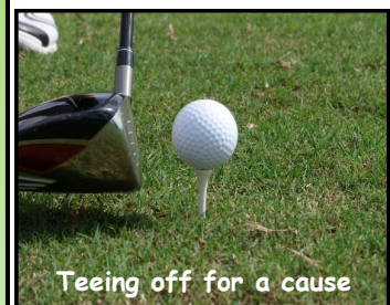
Teeing off for a cause