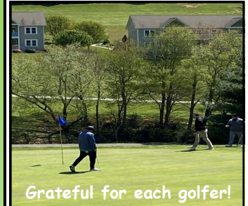
Grateful for each golfer!