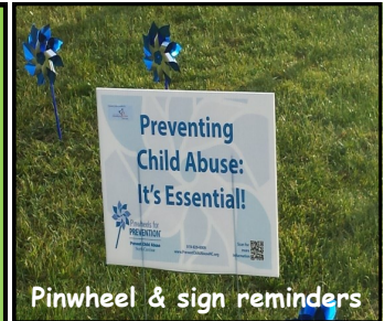
Pinwheel & sign reminders

Lowe's Home Improvement New River Brewing Parkway Theater Red Onion Café The Club at Irish Creek Women of Bethany