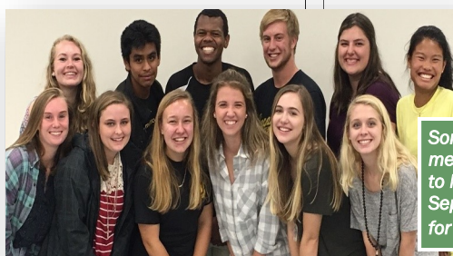
Some of the ACES members who came to NEST Kids on September 26, 2016 for the first time.