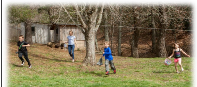
Pictured are children who are in the families of some of our directors. Running, in joy, toward the next, most exciting thing in childhood is what The NEST Alliance desires for all children.